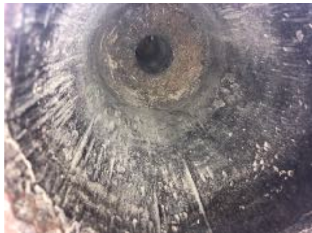
Longitudenal striations in the cannon from use