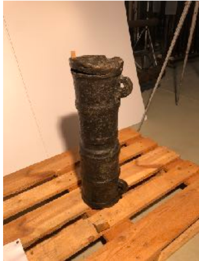
The original Cannon were damaged. Note the crack the top of the cannon

The process behind casting a cannon could be called lost wax technique as mentioned above, but it differs in many aspects from the traditional Cire Perdue technique. Luckily we have som very informative sources on how to make the mould for an early cannon, but these information only deliver some principal