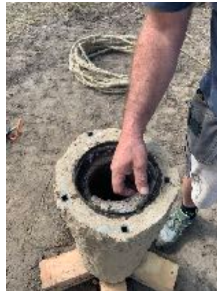
Removing the inner form after baking the mould