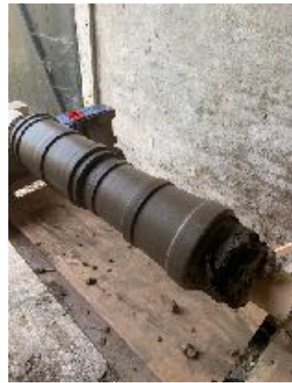
3 stages in producing the cannon mould

The group did 3 castings and made a couple of mistakes and learned a lot and we can say today that we have a pretty good understanding of how a reverbaratory furnaces works and we also have a good grip on making early cannon forms.