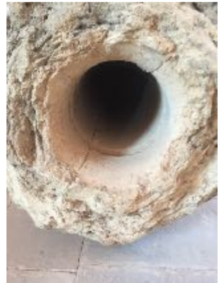
Preserved cannon mould from Jaigahr Fort, Jaipur